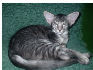
Silver Shaded Oriental LH = OLNhs11