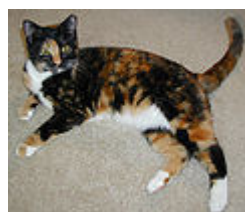
Black tortie & white HP = DSHf09