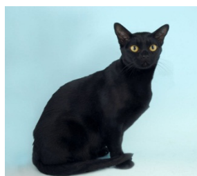
GCCF Bombay = ASSn