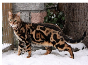
Brown Marble Bengal = BENn22