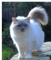
Lilac Pt. Birman = SB1c