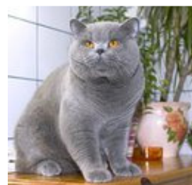
British Blue = BR1a