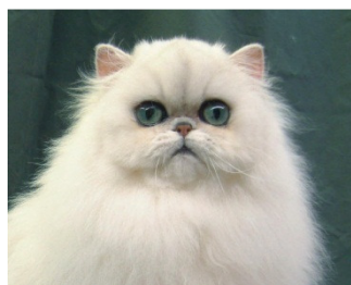
Chinchilla = PERns12