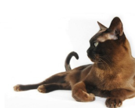
Brown Burmese = BUR n

*Transferring to the EMS system is for discussion and voting at the June Council Meeting 2013